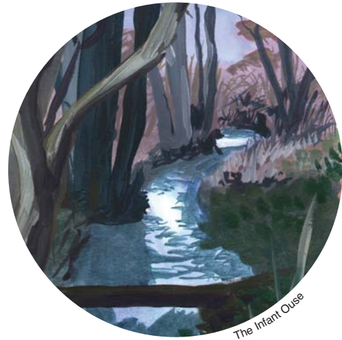
The Infant Ouse