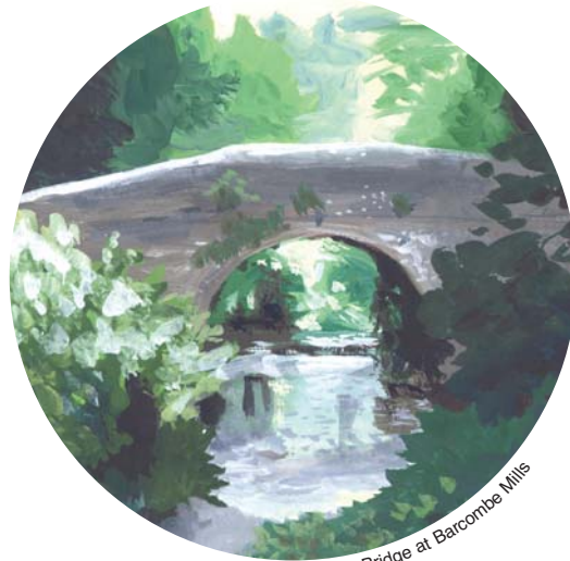
Pikes Bridge at Barcombe Mills