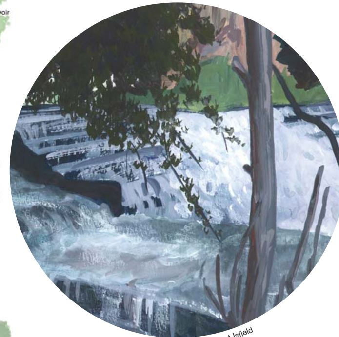
Falls at Isfield