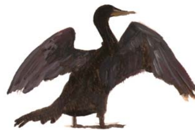
Cormorant at Newhaven

The Sussex Ouse Valley Way is a 42 mile (67 km) long distance footpath. It follows the course of the River Ouse from its source near Lower Beeding in West Sussex to the sea at Seaford Bay in East Sussex. Running mainly on existing rights of way, it was created as a partnership project and opened in 2005.