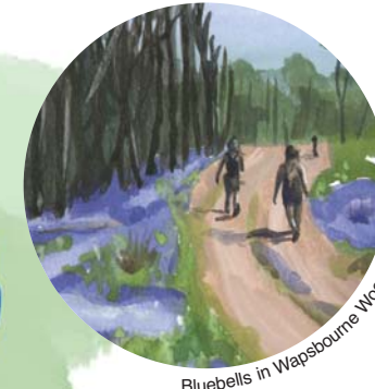
Bluebells in Wapsbourne Wood near Sheffield Park