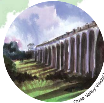
The Ouse Valley Viaduct near Balcombe