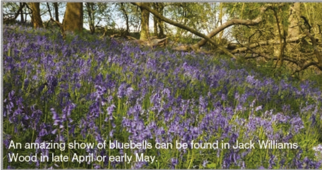
An amazing show of bluebells can be found in Jack Williams Wood in late April or early May.

E - Bricket Wood Common is an open space well worth a detour or special visit. It consists of diverse habitats including ancient semi-natural woodland, hornbeam coppice woodland, wet heath, ponds and seasonal streams. The Common supports an array of wildlife including great crested newts, butterflies, heather, fungi and bluebells. Cattle grazing has recently been introduced to maintain the balance between woody and shrubby plants and the species rich grass and heathland.