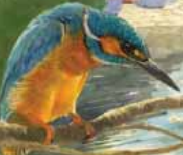
Kingfisher and Water crowfoot