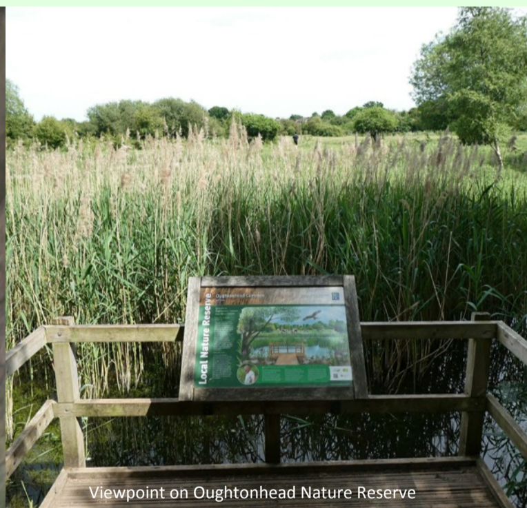
Viewpoint on Oughtonhead Nature Reserve