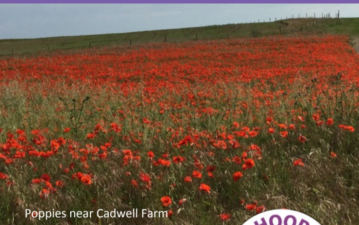
Poppies near Cadwell Farm