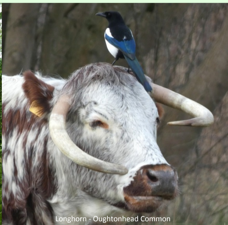
Longhorn - Oughtonhead Common