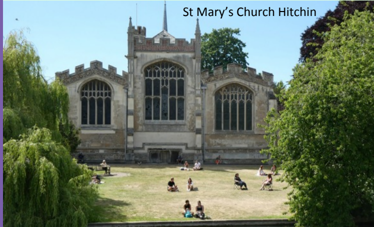
St Mary's Church Hitchin