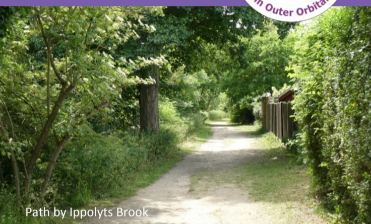
Path by Ippolyts Brook