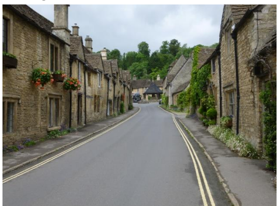
soaking wet from the outset.

to stop at the village pub for an early sandwich lunch before pressing on. I was surprised that the very private and apparently well-heeled golf club had bought up and enclosed a side road with a row of gorgeouslooking cottages, making them inaccessible to non-golfing visitors.