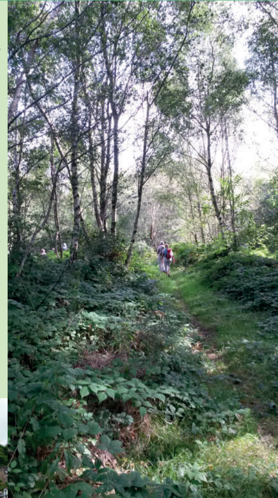
A lesser known path in Horsehay (above) and a world famous path in Ironbridge (left)

The Trail begins in Telford Town Park, goes down to Coalport and Ironbridge then on through Little Wenlock to The Wrekin, that marvellous Shropshire landmark. It then continues over The Ercall nature reserve through Wellington, Horsehay and Oakengates to Lilleshall, where you can walk to Newport via The Hutchison Way. After Lilleshall it goes through more areas of important industrial heritage, Granville Country Park and back to The Town Centre.